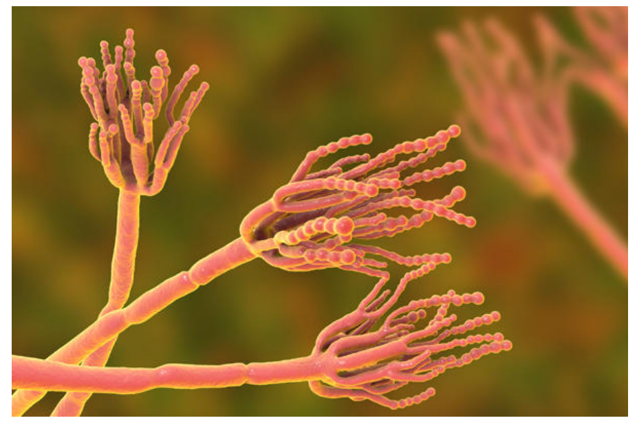
3D illustration showing spores conidia and conidiophore.

example stopping the mechanism responsible for building their cell walls.